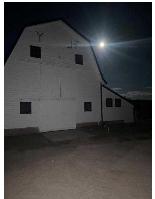
The Super Blue Moon a week ago