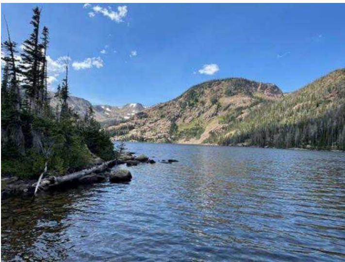
Rainbow Lake, in the Zerkel Wilderness