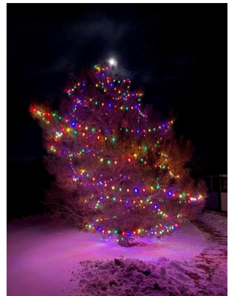
That's the moon on the top of the tree!