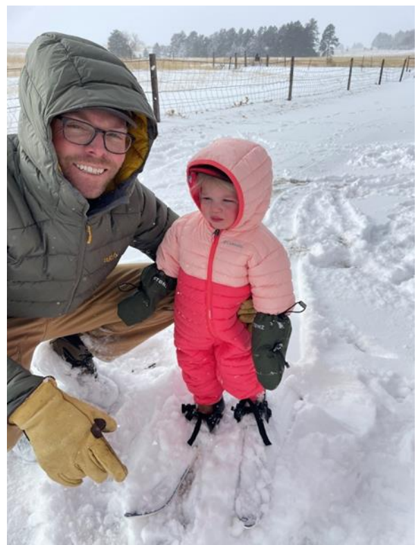
First time on skis!