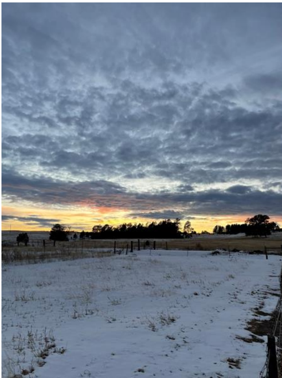
Last sunset of 2023