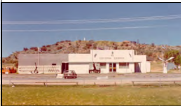
Alice Springs RSL Club 1977

The Colorado Chapter Summer Picnic is on July 7 th . This year's picnic will be at Matney Park on 7 July from 11am to 3pm. Matney Park is located at 5790 Lantern Cr., Castle Rock, CO 80104. The amenities are listed on the Castle Rock website: http://co-castlerock2.civicplus.com/Facilities/Facility/Details/27