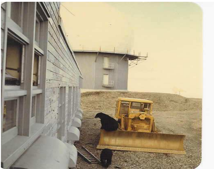
USAF S-61 Bears looking into chow hall