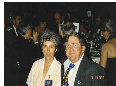
60h Annic_ATFAC Alumni Dinner Ed-