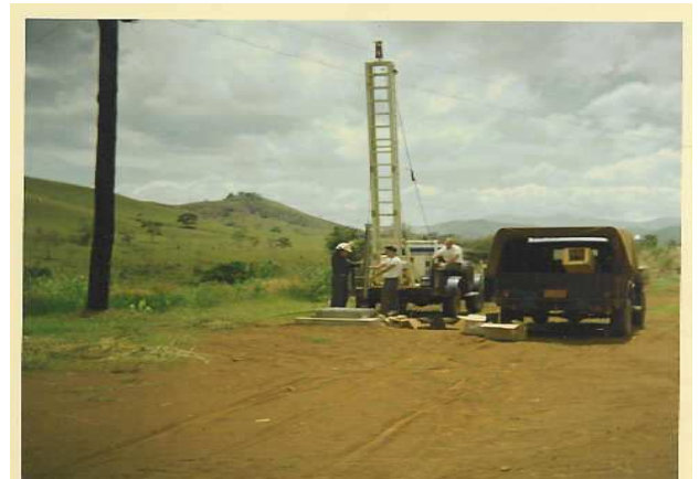
1966 Installing Teledyne-Geotech Equip in Phillipines-1