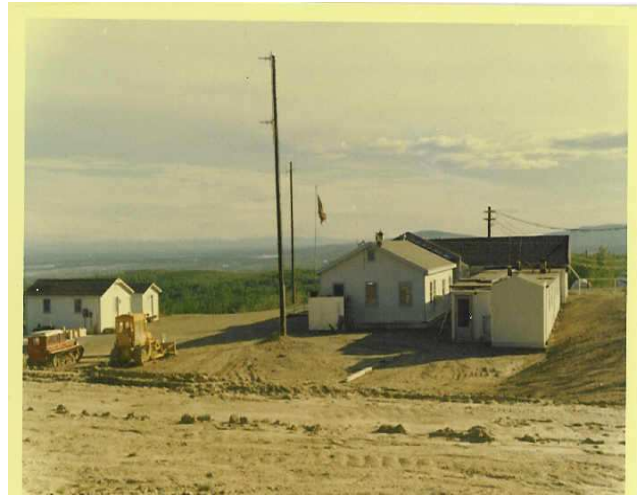
USAF Det 204 -1