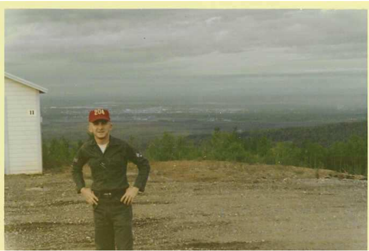
USAF Det 204 Ed-Fairbanks background