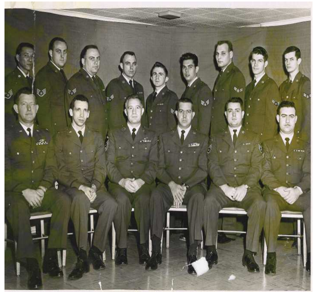
Det 204 Crew _ 1963