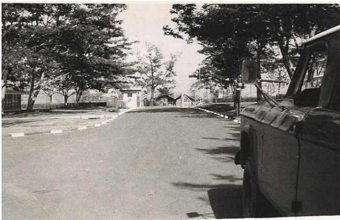
1966 USAF Det in PI